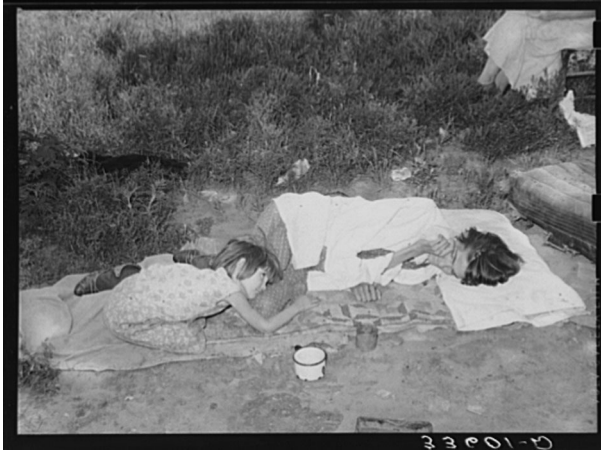
Fig. 4 Starving woman and child in 1930s Oklahoma. The photographer's note accompanying this image reads: "Tubercular wife and daughter of agricultural day laborer. She had lost six of her eight children and the remaining two were pitifully thin. The mother said that she had tuberculosis because she had always gone back to the fields to work within 2 or 3 days after her children were born. Shack home is on Poteau Creek near Spiro, Oklahoma."