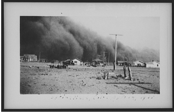
Fig. 3 Dust storm, Baca County. Colorado